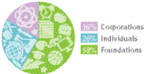
2011 SOURCES OF FUNDING ($749,885)